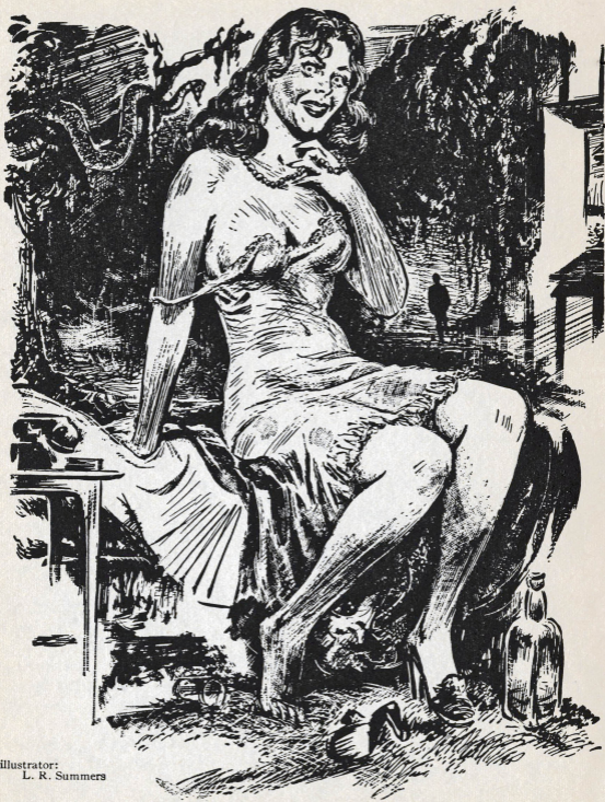
illustrator: L. R. Summers