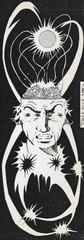
TRALE FICOT JONES

The lords wore black garments of refined cut, caps of jeweled metal