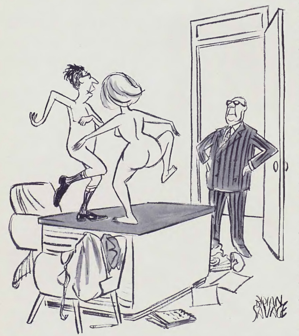
"Business is up 1.37 percent this quarter, and you ask why we're dancing?"