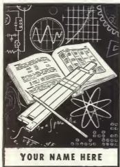
No. GF-614 by Emsh

The BEMs in your neighborhood won't run off with your books if you put inside the front cover of each book... a gummed bookplate with your name printed on it!