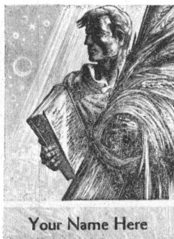
No. GX-57 by Lynd Ward