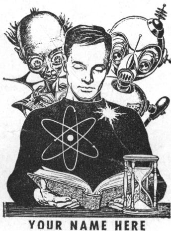
No. GF-612 by Emsh